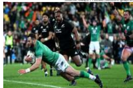
Figure 1 All Blacks home series loss to Ireland 2022. Creative commons. Joe Allison/Getty Images